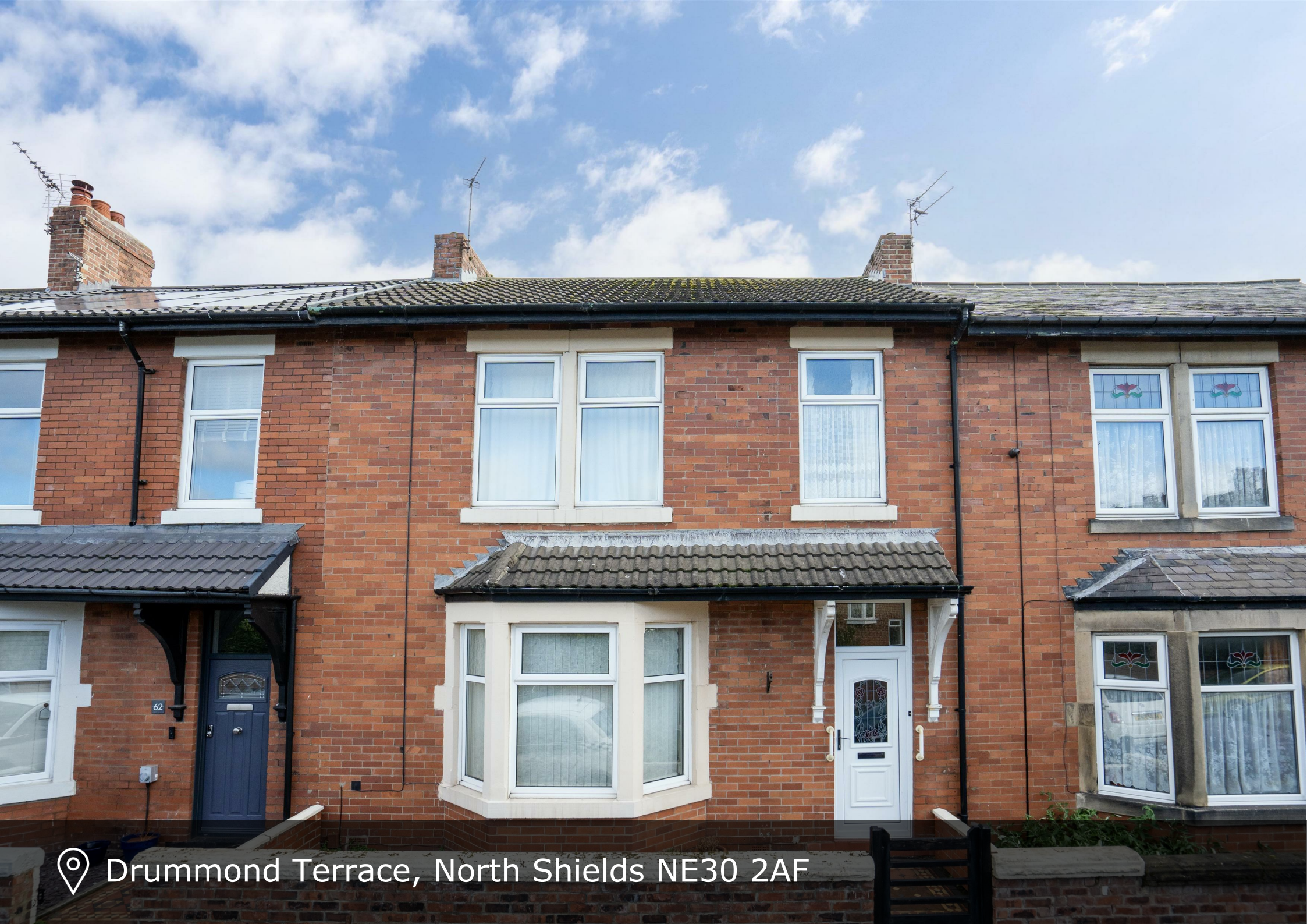
📍 Drummond Terrace, North Shields NE30 2AF